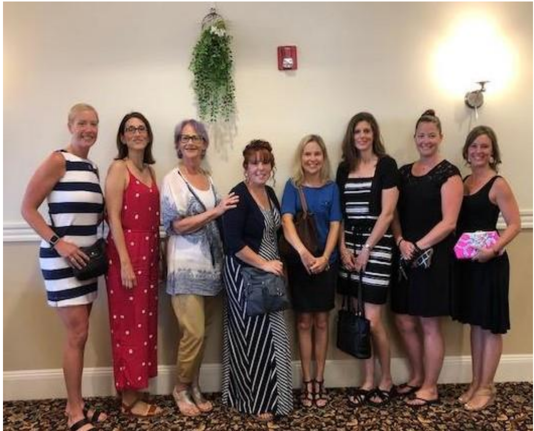
2019 Grant Recipients

Thanks to all those who participated in this annual fundraising event and hope you will again participate in the 2020 tournament scheduled for July 10, 2020.